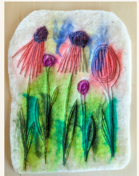
"The Poet Game" by Chrissy Valento.

Visit wholefoods.coop/art to learn more and apply.