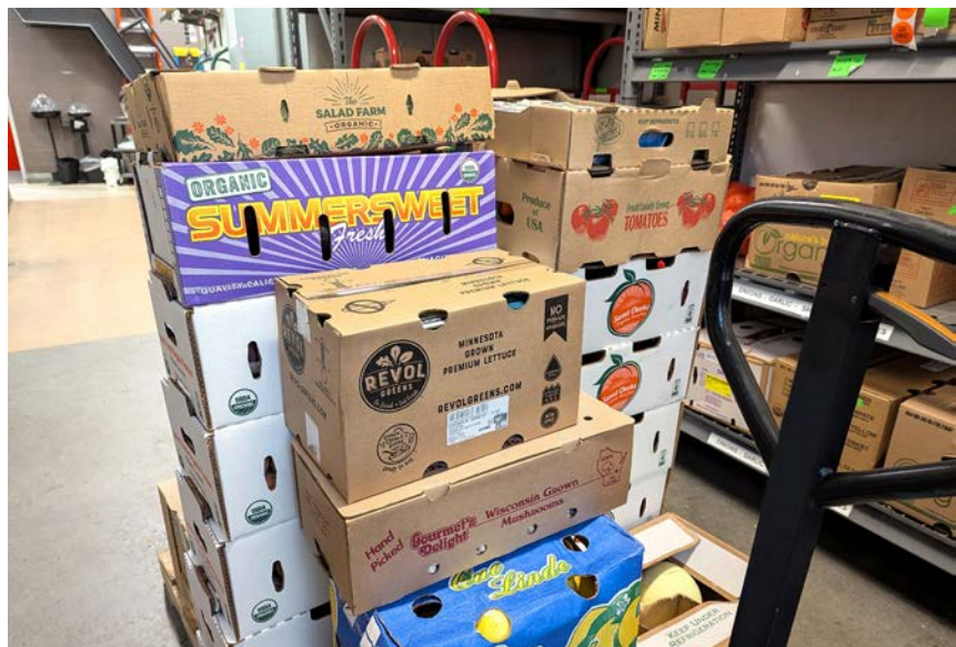
A CPW produce delivery arrives at Whole Foods Co-op.