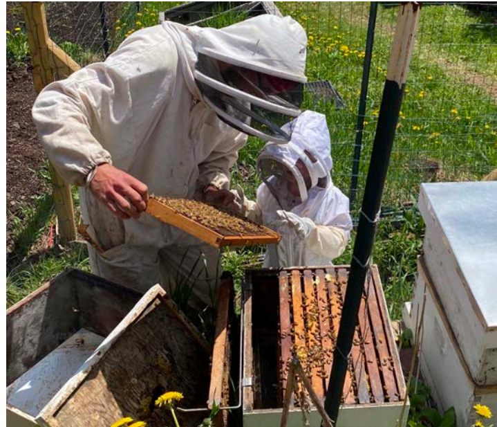
Beekeeper-in-training at Observation Hill Farm

But truthfully, honey isn't about humans. It's the natural product made by bees—one of our planet's most important insects. Honey bees visit millions of blossoms in their lifetimes, collecting nectar to bring back to the hive, and making pollination of plants possible. All pollinators play an indispensable role in food production. Three-fourths of the world's flowering plants and about 35 percent of the world's food crops depend on animal pollinators to reproduce. According to Elaine Evans, extension educator at the University of Minnesota, "Pollinators directly impact our food supply, with about one out of every three bites of food you eat dependent on pollinators," Evans says. "Not only that, but pollinator-dependent foods tend to be our most nutrient-dense foods, like fruits and nuts. Looking beyond our own food supply, about 80 percent of plants depend on pollinators for their survival and these plants feed countless creatures, filter water, and build soils. Pollinators are an essential part of our ecosystem." Many, like the Minnesota state bee, the Rusty Patched Bumble Bee, are endangered.