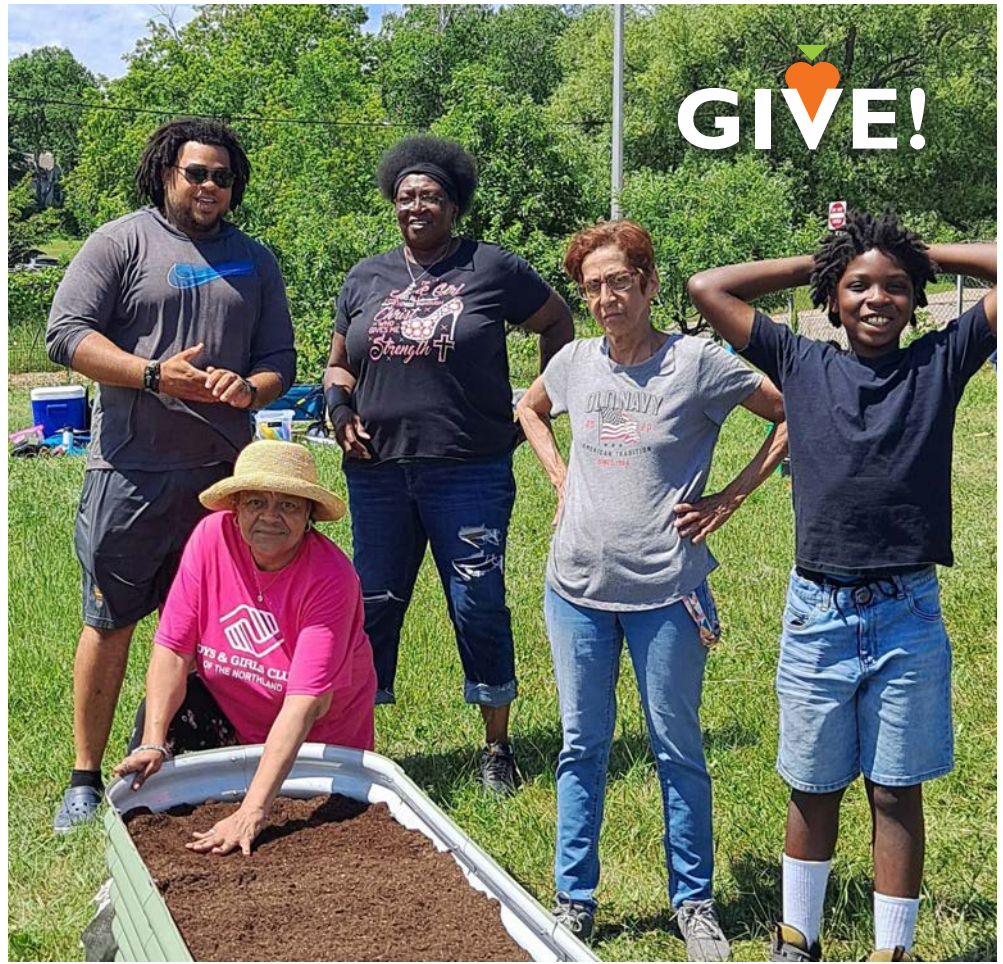
Family Freedom Center + Grow Local Food Fund are the GIVE! Round Up recipients for August 2022. PAGE 7