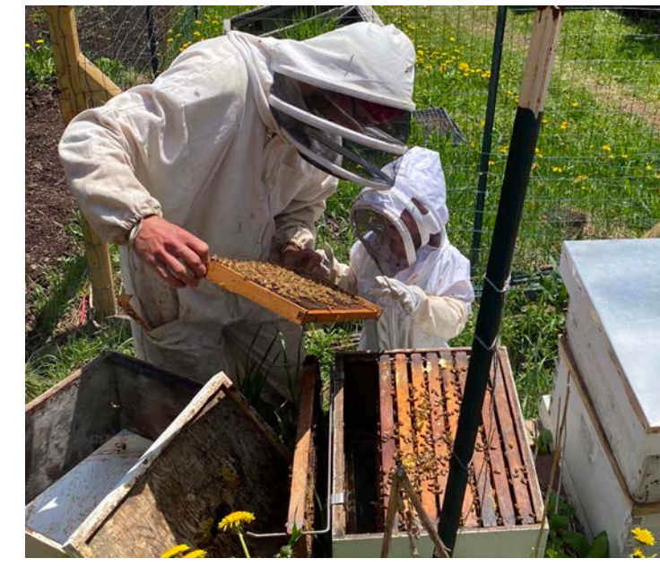
Beekeeper-in-training at Observation Hill Farm

pollinators to reproduce. According to Elaine Evans, extension educator at the University of Minnesota, "Pollinators directly impact our food supply, with about one out of every three bites of food you eat dependent on pollinators," Evans says. "Not only that, but pollinator-dependent foods tend to be our most nutrient-dense foods, like fruits and nuts. Looking beyond our own food supply, about 80 percent of plants depend on pollinators for their survival and these plants feed countless creatures, filter water, and build soils. Pollinators are an essential part of our ecosystem." Many, like the Minnesota state bee, the Rusty Patched Bumble Bee, are endangered.