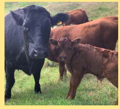
Photos and article courtesy of Yker Acres. Find Yker Acres beef and pork products at Whole Foods Co-op!

The Stamper family – Joshua, Alison, lasper (II) and Griffin (9) – are the new owners of Yker Acres, a heritage breed, farrow to finish pork and beef farm that is committed to humanely raising animals outside. As Joshua puts it, "Animals need to be able to express their natural interests and behaviors, and they are not able to do that when they are in confinement barns with concrete floors. That's what make Yker Acres different from other brands in the meat case. There is a difference and you can taste it. Happy pigs taste better!" The Stampers are excited to bring the very best pork and beef to folks in their community and the Lake Superior Watershed.