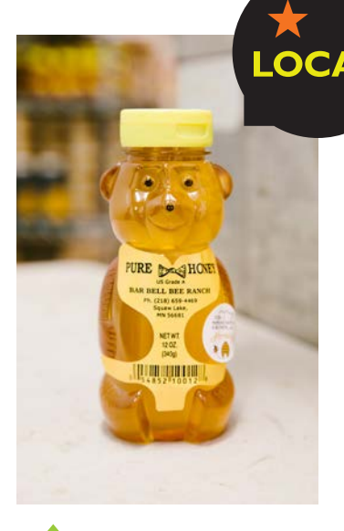
Find Bar Bell Bee honey at Whole Foods Co-op!

All four are relatively easy steps to ensure a diverse and sustainable food system (and plenty of honey) for generations to come!